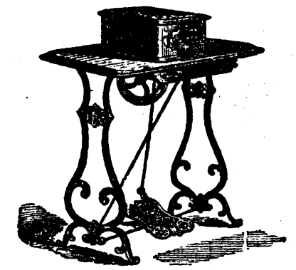
Casket Machine, Complete. Price $30.00.

The above cuts show the style of two of our LOW PRICE DOUBLE-THREAD MACHINES, which we can strongly recommend for all kinds of family purposes, as being equal to any Machine ever made. In addition to the above, we also build the following popular styles of Sewing Machines for Family and Manufacturing purposes:—