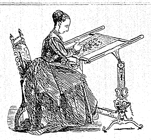
WANTED A WIFE.