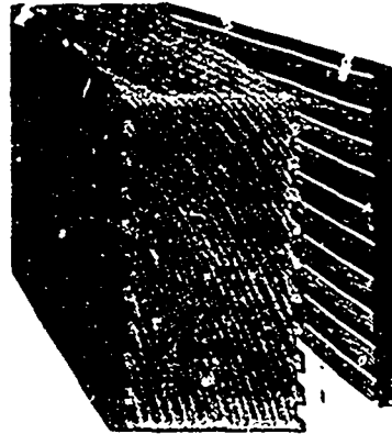
SECTION SHOWING PROCESS