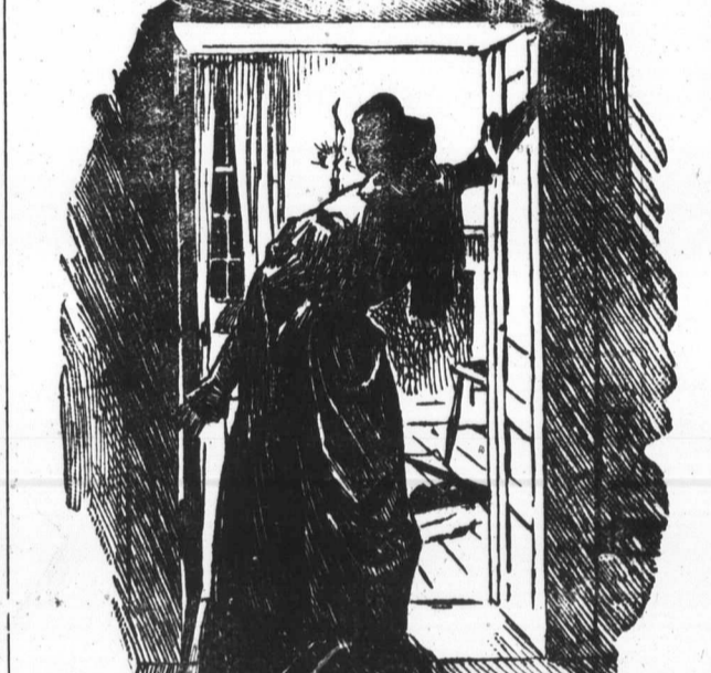
IT WAS THE STILLNESS OF INTENT RATHER THAN THAT OF NATURAL REPOSE.