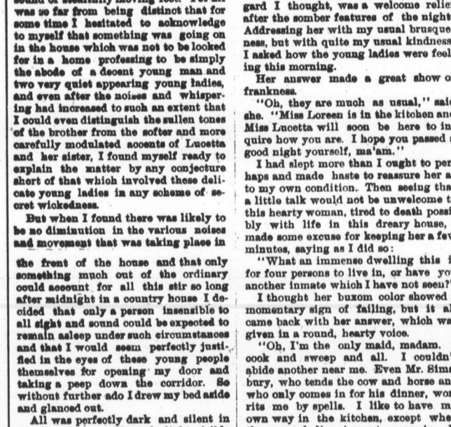
IT WAS THE STILLNESS OF INTENT RATHER THAN THAT OF NATURAL REPOSE.