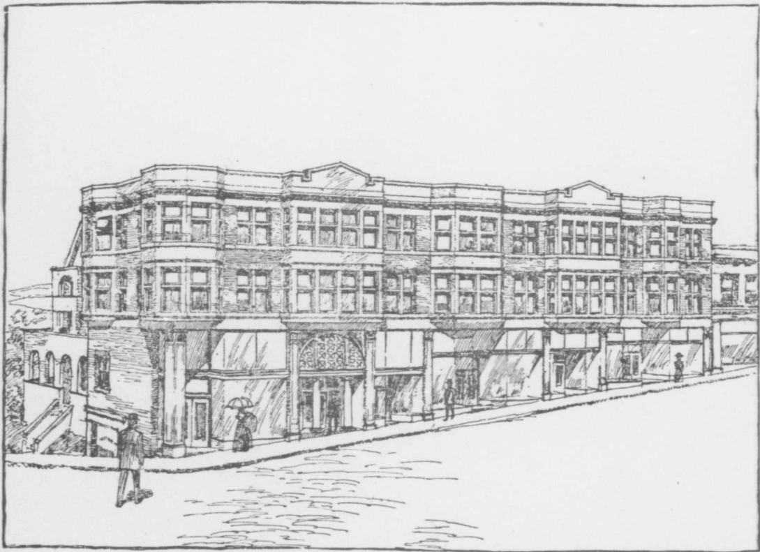
SOMASS HOTEL EXTENSION