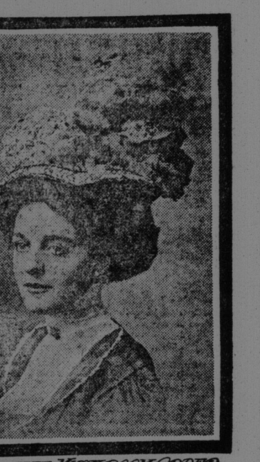
ON THE MOUNTAIN TOPS