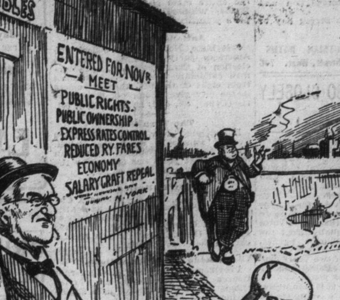
OLD MAN YORK: Like to ride for my stable, eh? Well, I'd think about it if I didn't know that the men for whom you have been riding are the men who stab you to me—and that they have all their money up against my horse.

Philadelphia, Nov. 7.—Philadelphia has been swept by the reform movement, the city party winning by a surprisingly large majority.