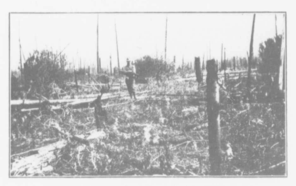
Salmon River Land Requires Little Clearing

North American. The climate is right for that breed of horse, it will produce the bone with quality and quantity of feather, while the legumes—clovers, vetches, alfalfa and peas—with as good timothy and oats as can be grown in the world, with all of the various root crops produced in abundance, should do for him and grow for him to the Scotchman's delight. And I think what has been said for the horse will apply with equal force to the production of meat-cattle and mutton-sheep."