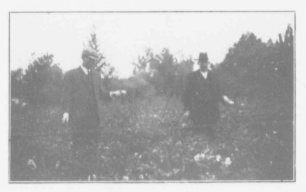
Potato Crop, Salmon River Country