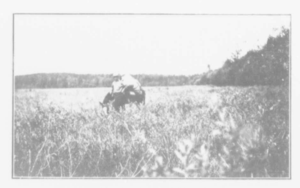
Salmon River Open Natural Wild Hay Meadow

soil, climate and general conditions, it gives me great pleasure to write you my opinion of your lands in the Salmon River Valley.