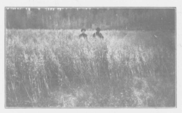
Oats Are Being Most Successfully Grown in Salmon River Country

From the Vancouver Daily Province, October 5th, 1912: EXPERIMENTAL FARM NEAR FORT GEORGE. Dominion Government Reported to Be Considering Establishment of Station.