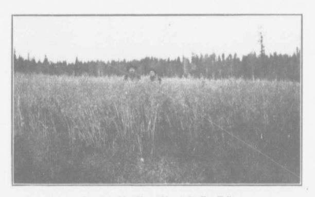
One of the Men Shown Here is Six Feet Tall

Travelling over rail, stream and trail throughout the magnificent scenery of Central British Columbia, the special correspondent of the Sun has now arrived at Fort George, truthfully described, "The Heart of B. C." The tale of progress which unfolds itself before the eye of the traveller as he traverses the country between Prince Rupert and this thriving, embryonic city is remarkable in the extreme. Much has been done to redeem the wilderness and harness it for the purpose of contributing to the