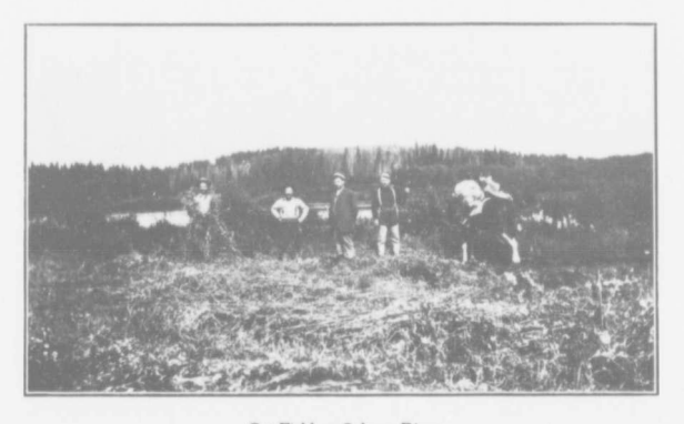
Oat Field on Salmon River

Other offices: Victoria, B.C., New Westminster, B.C., Nanaimo, B.C., Calgary, Alta., Regina, Sask., Montreal, P.Q., London, Eng., Antwerp, Belgium.