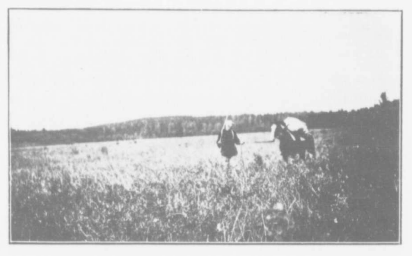
Salmon River Natural Open Hay Meadow Ready for Plow

"I send draft for $470.00 for option on north half of section 607."