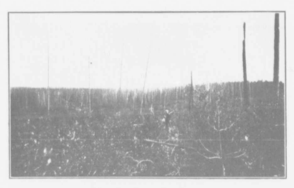
Salmon River Burned Over Country

prosperity of man. But it is apparent to the observant passer-by that what has already been accomplished is but a small part of the great transformation which the next decade, or less, will see accomplished.