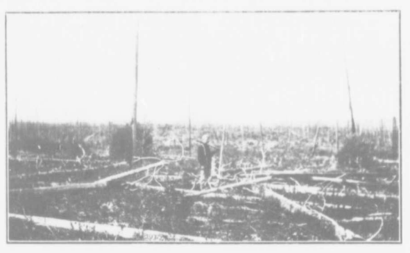
Salmon River Land Requiring Little Labor to Cultivate

"The stock we saw while en route throughout the whole of British Columbia were notably in good condition, especially the cattle and mutton breeds of sheep, that looked as a rule fit for the shambles. I believe the Upper Fraser River Basin will not only prove a good "mixed farming" and "dairy farming," but the conclusion is forced upon me that this section will be able to produce the best type of British draft horse that can be bred in