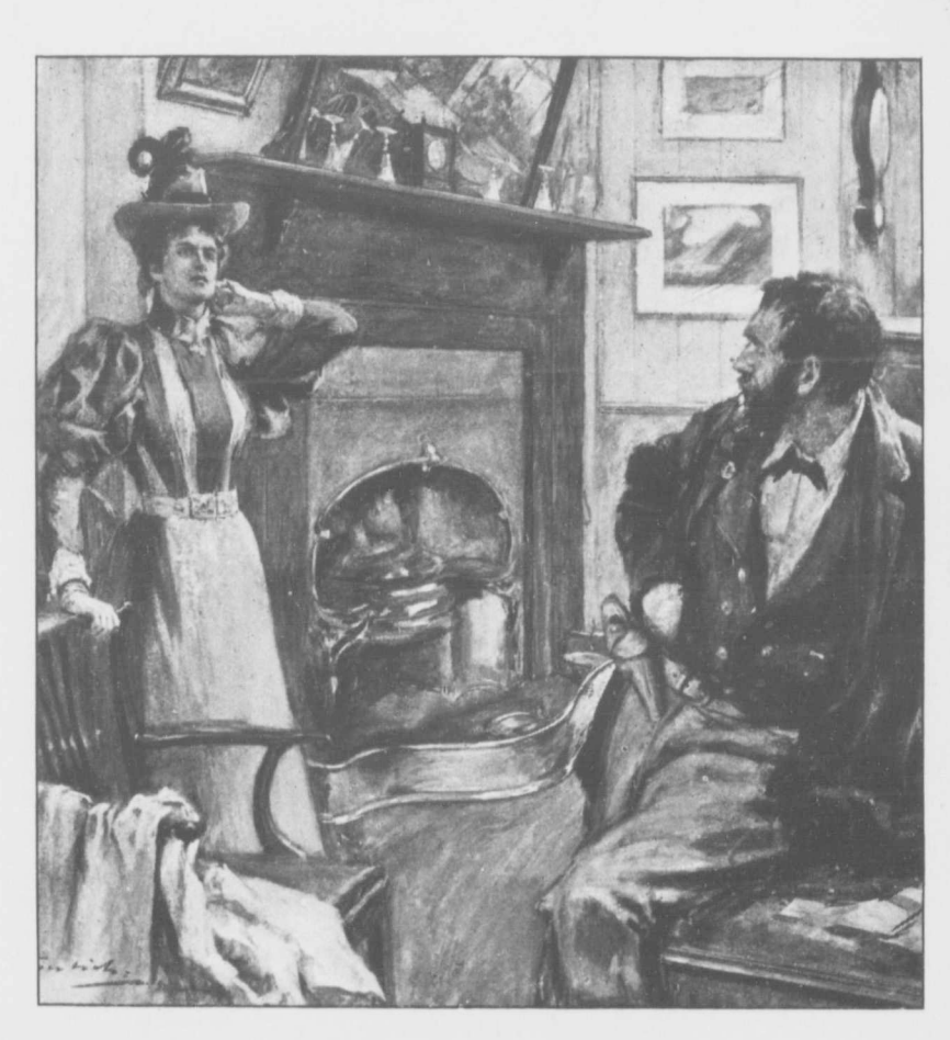
'Where's the money?' he said.