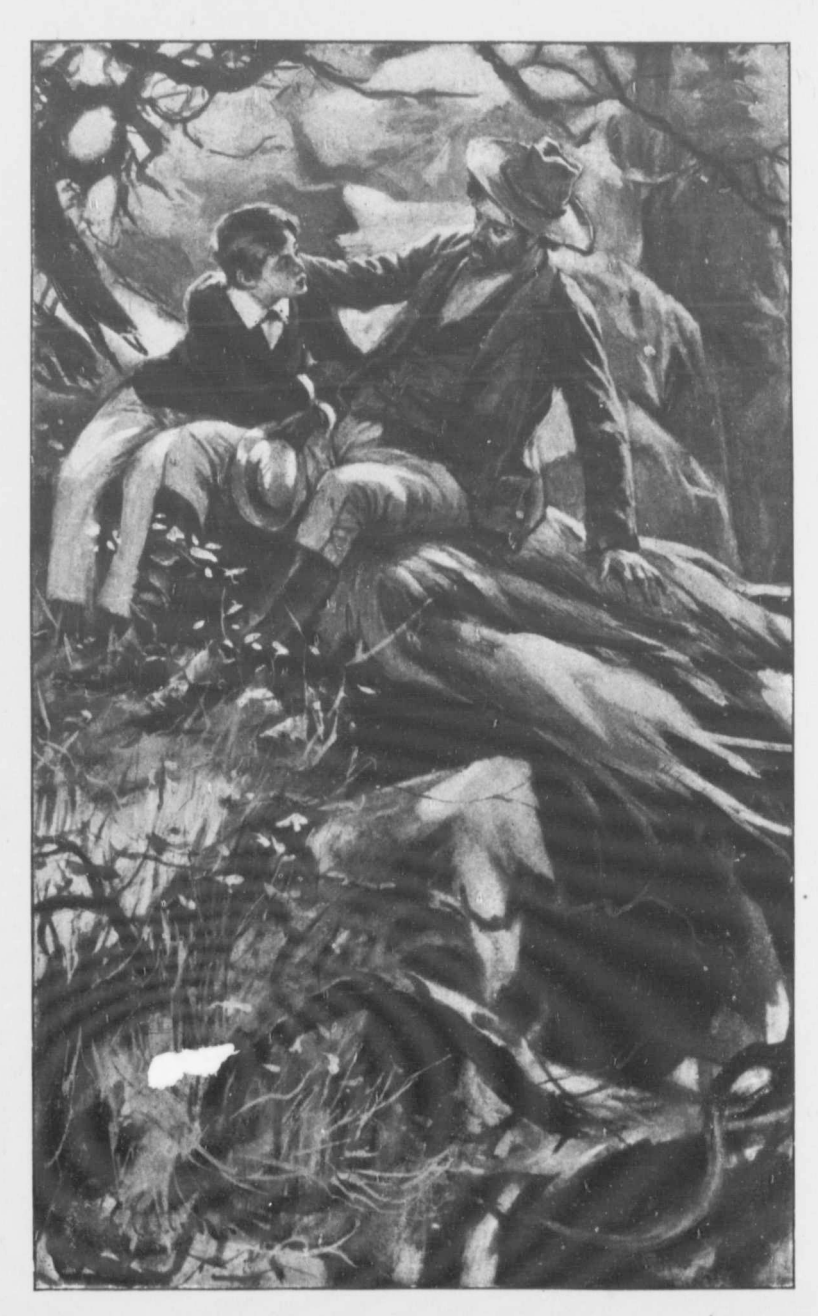
They sat, looking down upon the road.