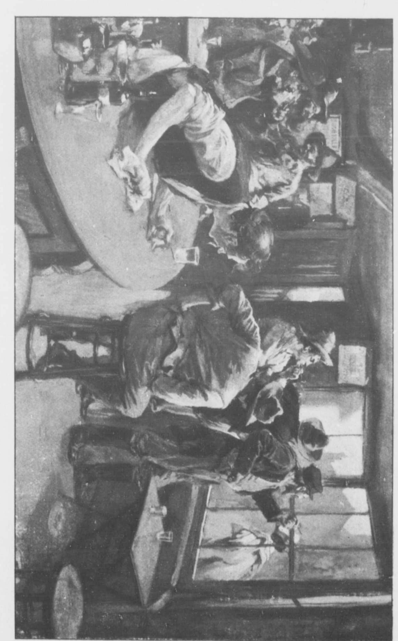
They were all startled at the apparition of Mrs. Barker.