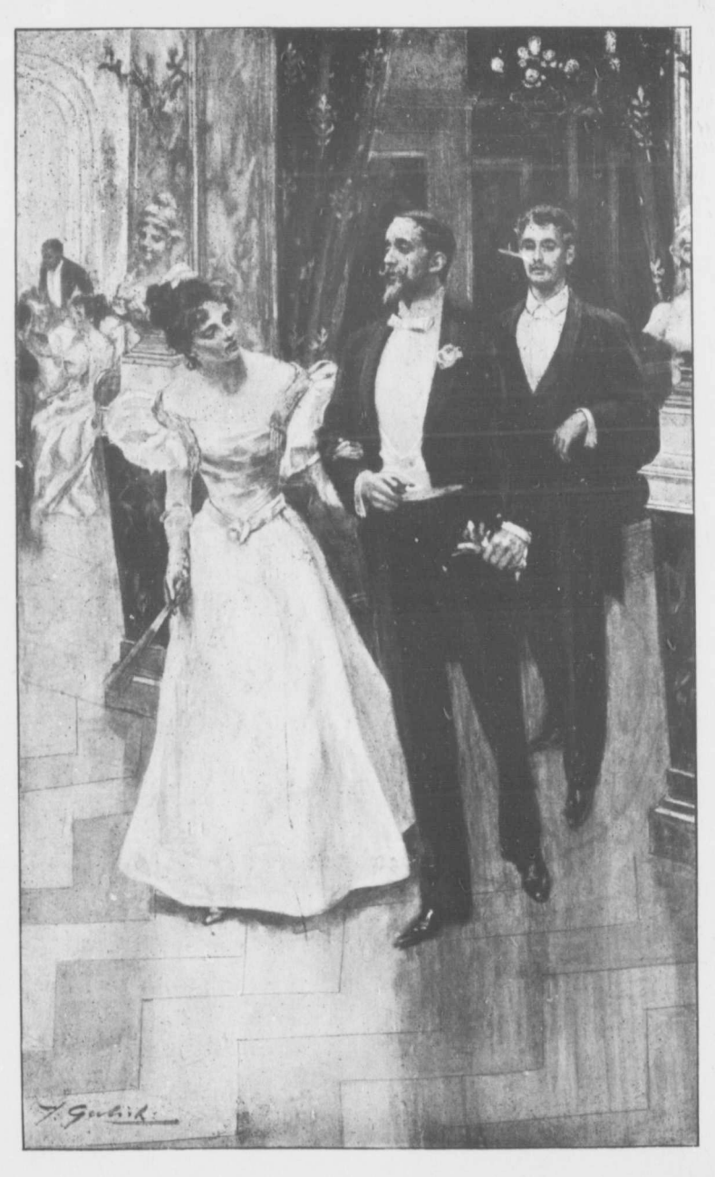
She leaned upon his guest's arm, chatting confidentially. [p. 95.