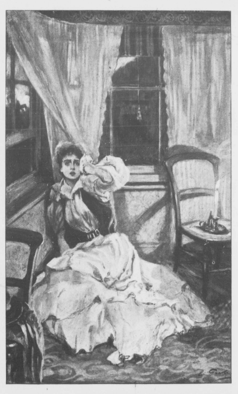
The room reeled arouna her.

the di the ho of go her o often begar no rea of hi faithl that even said thus at he soun her. and, The talki stabl