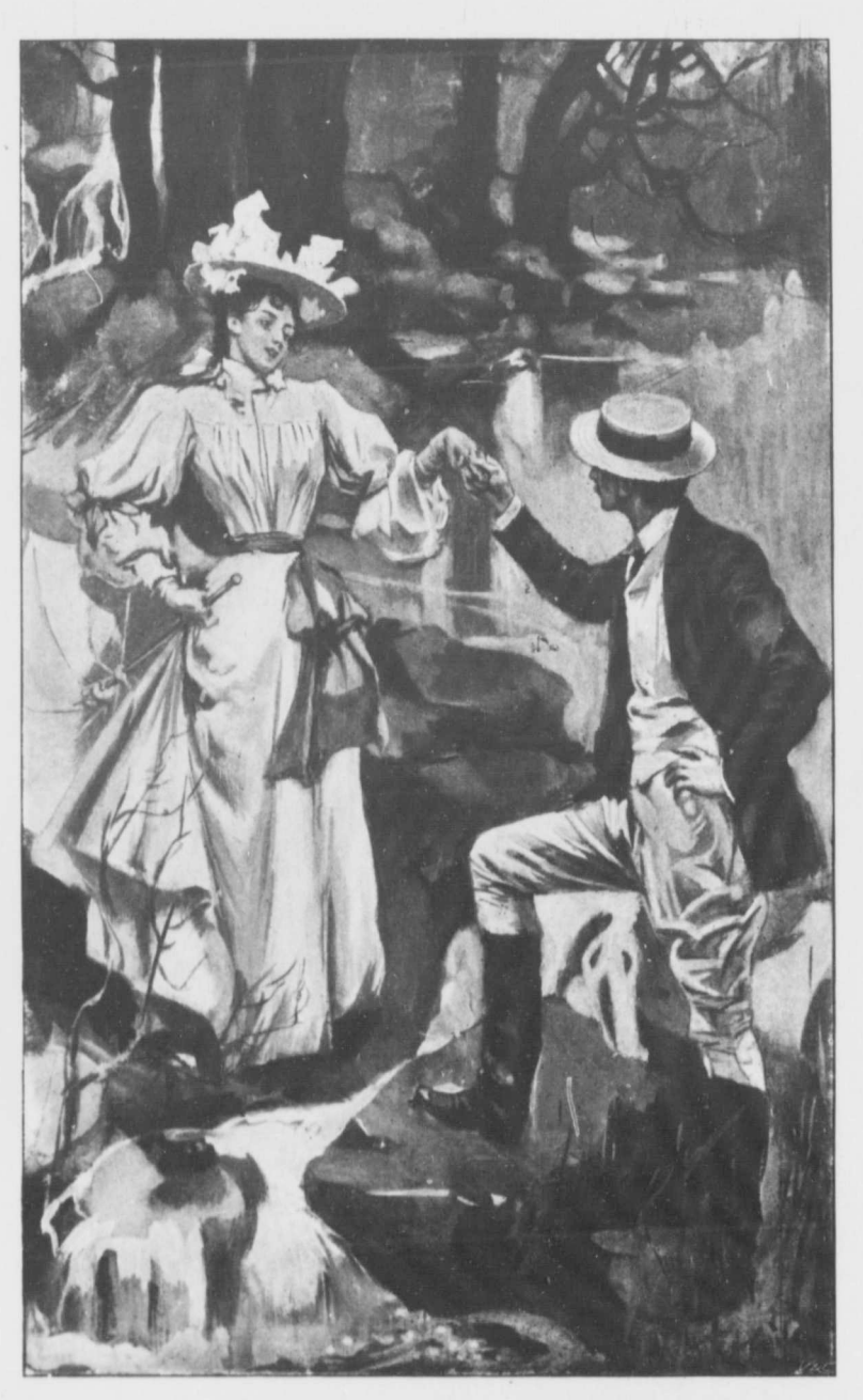
They emerged, holding each other's hand.