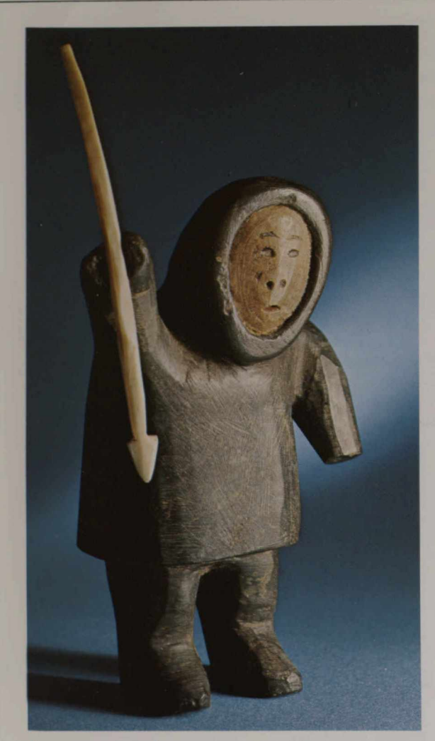
Hunter, stone and ivory, from Port Harrison.

little is known about them, and in particular it is not yet known whether their culture evolved in the Eastern Arctic or whether they were immigrants there. Radio-carbon dating indicates that the Dorset culture began over 2500 years ago. A number of Eskimo legends refer to a strange people called the Tunit who lived in stone houses and were gradually dispossessed by the present Eskimos. It has been thought that the Tunit were the Thule Eskimos, but the evidence indicates rather that they were the Dorset people.