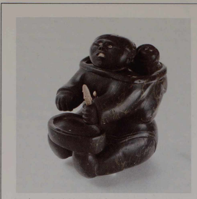
Mother and Child with Fish, green and orange stone and ivory, from Port Harrison.

elsewhere. It is probably from their accounts that most of the children's stories about Eskimos spring.