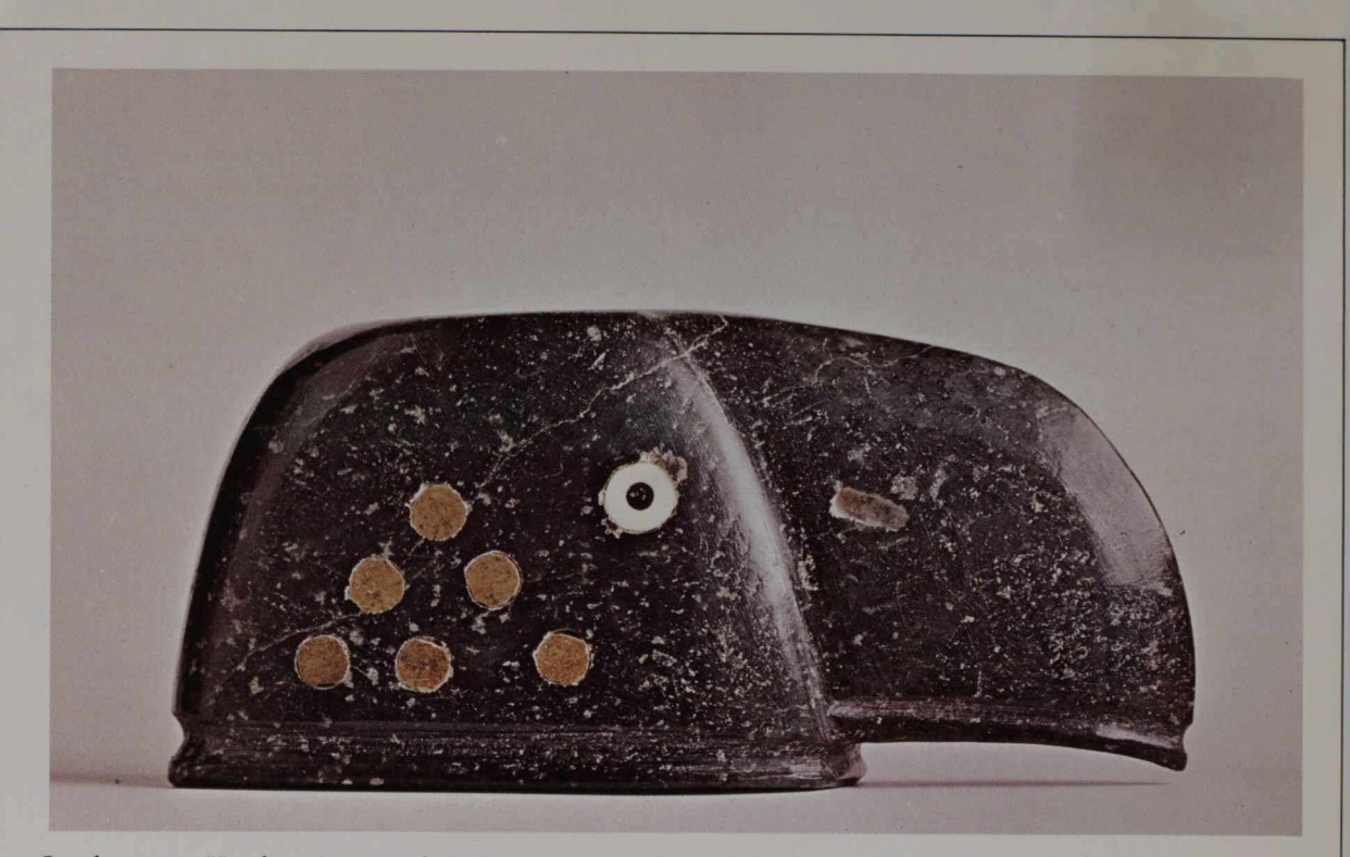
On the cover, Howling Spirit and Its Young, green stone, from Cape Dorset. Above, Bird's Beak, stone and inlays, from Port Harrison. A review of two books on Eskimo sculpture begins on page 11.

People have a number of strange ideas about the Eskimos. One of the strangest is that they are a little-known people. Nothing could be farther from the truth. Ever since the Eskimos were discovered, people have been writing about them. There are a number of detailed scholarly accounts covering almost every aspect of the life of several Eskimo groups. There are some general accounts and a fair number of novels. These books are an interesting mixture of fact and fiction, of understanding and misunderstanding. The reader's problem is that of distinguishing the one from the other.