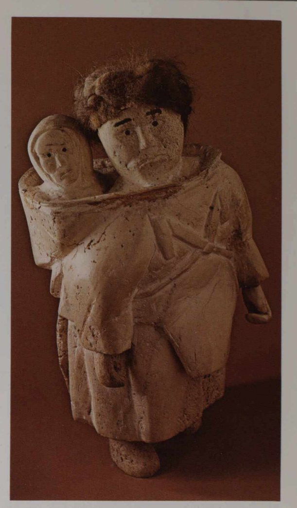
Mother and Child, whalebone and hair, Cape Dorset.

long controversy, but the evidence seems to be very much in favour of a Bering Strait origin.