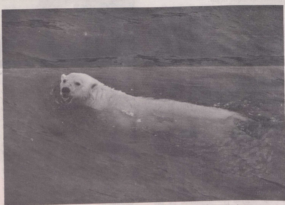
Large male polar bears stalk the leads for seal birth-lairs, make the kill, then eat only the skin and some blubber before moving on. The remaining carcasses provide food for female and young bears and Arctic foxes which would have difficulty finding enough food for themselves.