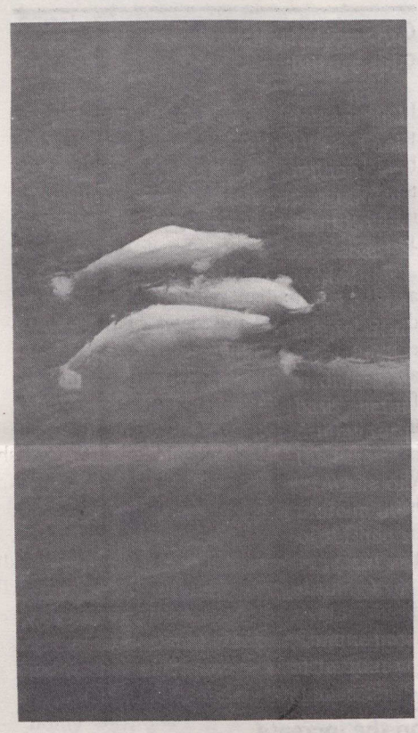
The birth of beluga or white whales has never been witnessed or recorded. The beluga whale's main food is squid, polar cod and invertebrates - predators are killer whales, polar bears and man.

Sea mammals - To gather information on the number and movements of seals and whales; to help identify areas and times when the mammals may be sensi-