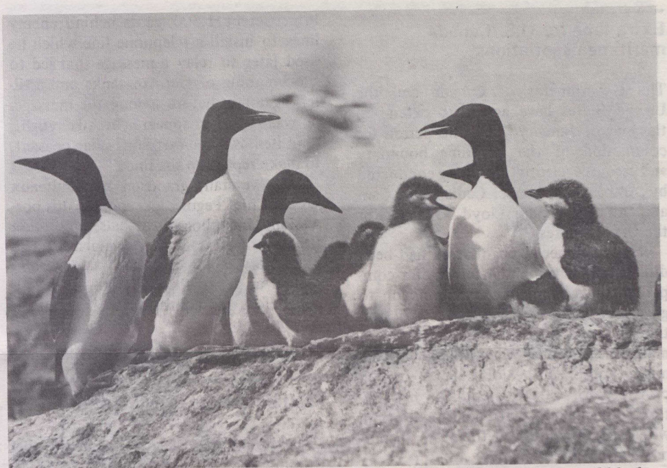
Common murres raise only one chick per pair and must be four to five years old before becoming sexually mature. At the end of summer, groups of flightless juveniles, usually with one or two adults, swim on an easterly migration to winter in Greenland.

Research will also be carried out on ocean fish, Arctic char and inshore fish, zooplankton distribution, sea-bottom animals, effects of oil on mammals, oil degredation and dispersal, oil-spill trajectories and contingency planning. In addition, the research ship CSS Hudson will make two trips into Baffin waters to collect water samples for analysis and to examine the rock formations under the sea.