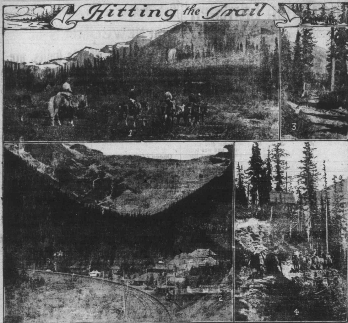
(1) Trail to Yale Valley. (2) C.P.R. Station and Hotel at Glacier. (3) The Trail to the Hicelllewaet Glacier. (4) A Mountain Trail.

CANADA is a land of trails. Trails over mountains and hills, across prairies and through forests, by the banks of rivers beyond number and across country toward a distant sky line. Trails made by red men, by white men, and by nature. But the mountain trails are the most alluring of them all, and hitting trails is the rarest of sport in Rockies or Selkirk, all the way from the Kananaskis Pass on the east to the Yale gateway on the west. The trail traveller feels the charm of the trail as soon as it is hit. It keeps you guessing where it is a hit-or-miss highway, where you require the keenness of an Indian to tell the way by the slightest of signs—a few twigs broken here, the mould of a horse's foot there, a blazed tree yonder, and then there will be a skip