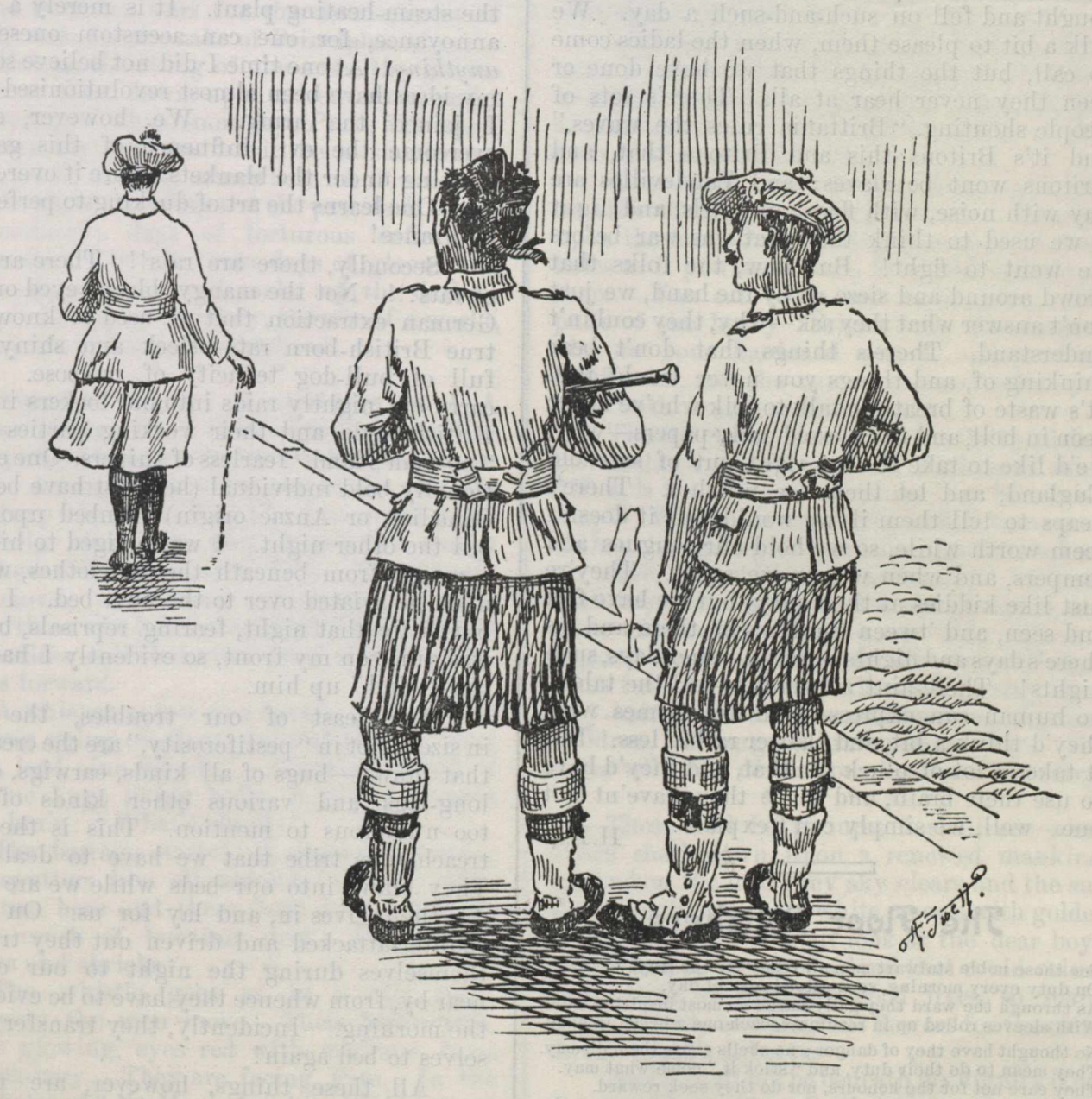
Eh Mon! I' that suppossed to be kilt 'r skir-rt.