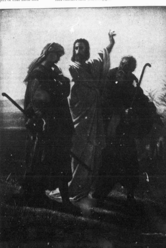
ON THE WAY TO EMMAUS