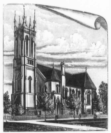
GEORGE ST. CHURCH, PETERBORO'.