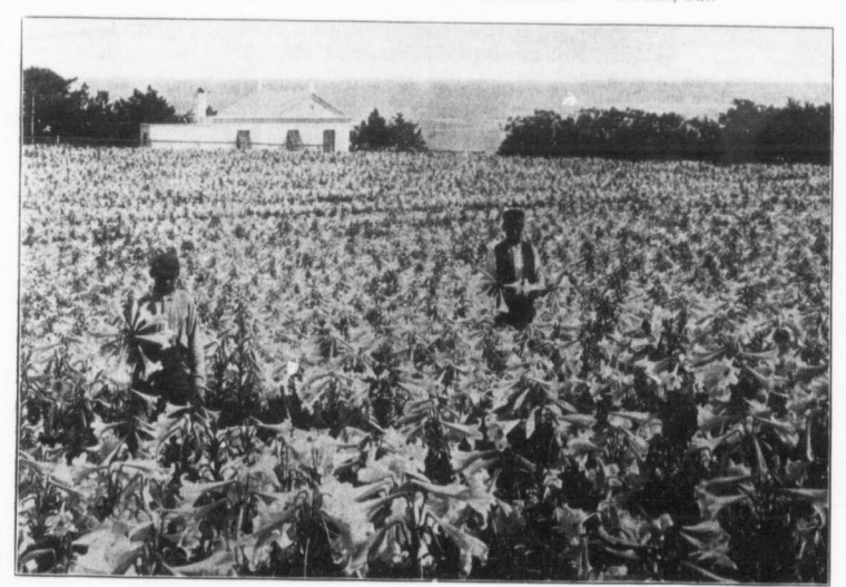
A BERMUDA LILY FIELD AT EASTER.

nor the sweet fragrance have burst its confines to enrich the Easter air.