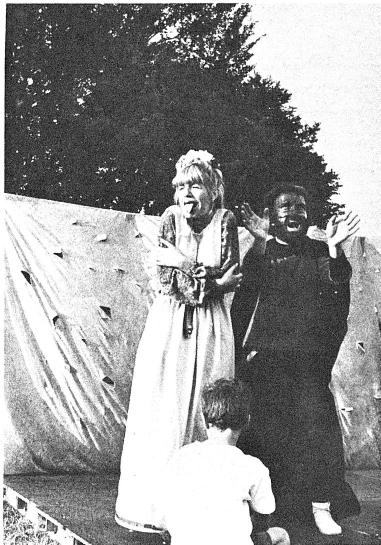
THAT'S REALLY WHAT BRAND X IS ALL ABOUT?? Whatever it is, the Vancouver Street Theatre looks interesting. They'll be at the SUB Theatre next Monday noon giving a free performance. Try to make it.

One pretty co-ed asked who the Everly Brothers were and when asked if she hadn't read of them in The Gateway replied, "What's The Gateway?" She had read only her handbook on birth control.