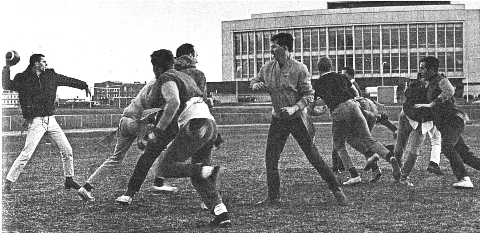
INTRAMURAL FLAG FOOTBALL IS ONCE AGAIN UNDERWAY . . . this year with 91 teams (14 more than last year) and three divisions