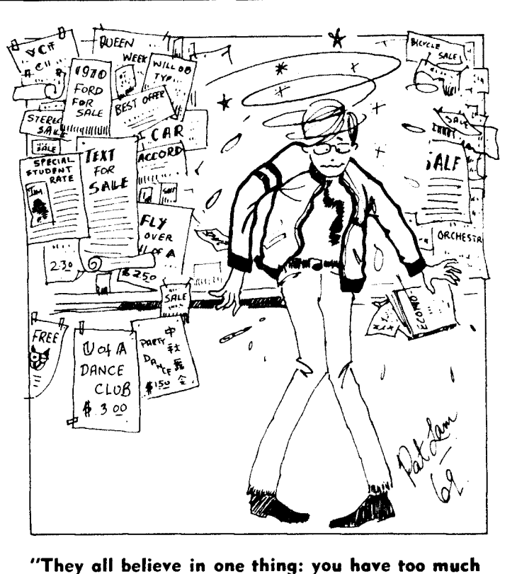
money in your pocket."