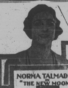
NORMA TALMADGE "THE NEW MOON"

A field marshal never retires, but remains on the active list and draws full pay till the day of his death.