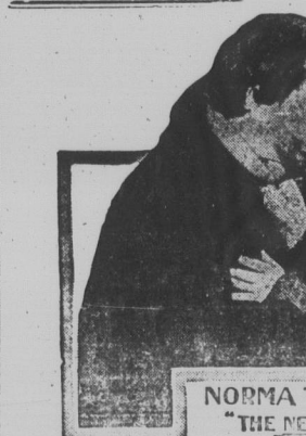
NORMA TALMADGE "THE NEW MOON"

The rail on the section from Matapedia to New Carlisle is a very light rail and is the same rail that was down when the road was constructed some thirty years ago. Some of the timber limit owners were contemplating putting up another pulp mill on the coast recently, but were obliged to abandon on account of the railway situation.