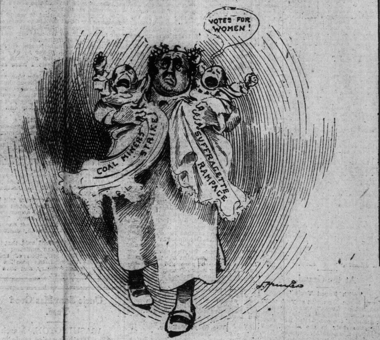
MR. BULL: Believe me, I'm jolly well tired of it.