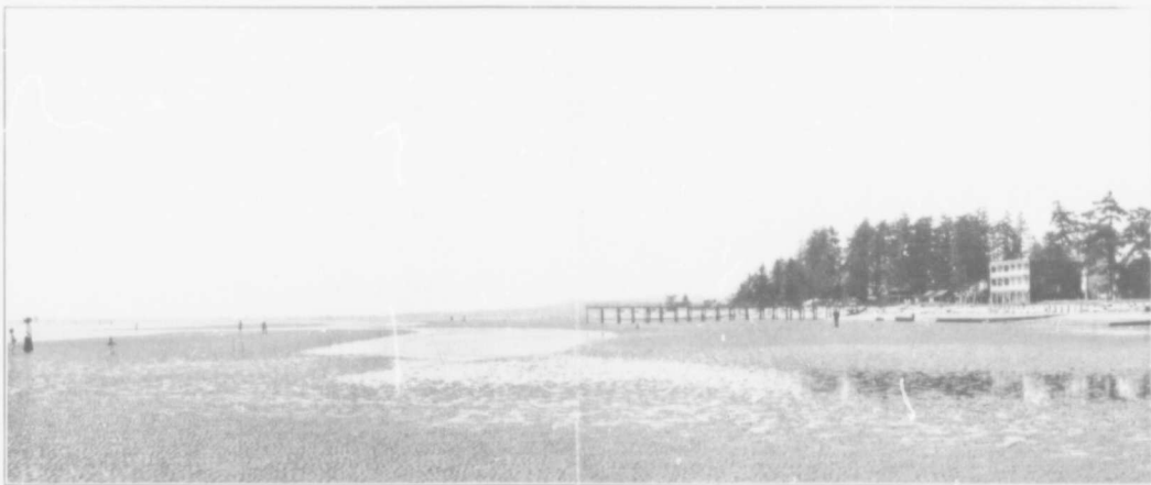
Part of Crescent Beach's Two-Mile Bathing Beach

The water is exceedingly warm and clean and the beach perfectly safe, even for the smallest kiddie. Careful management prevents any rowdyism on this beach; in fact, throughout the whole community.