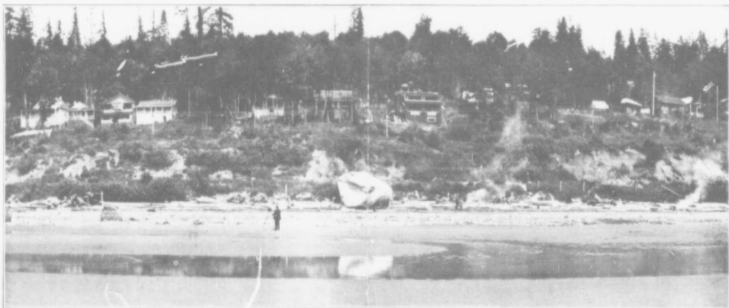
"White Rock"—A Glorious Stretch of Clean, Warm Sand Leading Fully One-Half Mile to Salt Water

can be obtained very reasonably for rent or for sale, and there are a limited number of free tenting sites available. The water supplied to each lot is from flowing artesian wells and is of a purity equal to any of British Columbia's famous mountain streams. There are no mosquitoes and a delightful breeze with the fresh tang of the ocean fans all of White Rock, keeping the hottest summer days cool and making the nights comfortable.