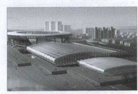
The 17,000-seat National Swimming Center slated for the Beijing 2008 Olympics.

With the environment a major theme for the upcoming Games, the term "Olympic Green" takes on a whole new meaning. The 2008 "Green" Olympics will be a great leap for China on the road to sustainable development. Billions of dollars will be spent on reducing air and water pollution, treating waste, reforestation, "green" energy, and environmentally friendly products.