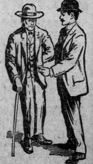
A FRIEND IN NEED.