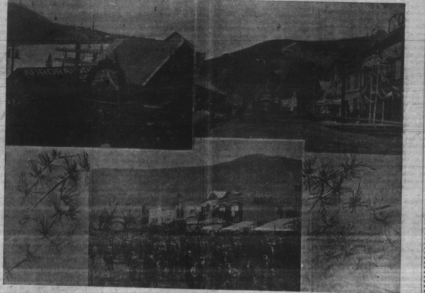
DAWSON IN GALA ATTIRE DURING VISIT OF GOVERNOR-GENERAL, AUGUST, 1900.