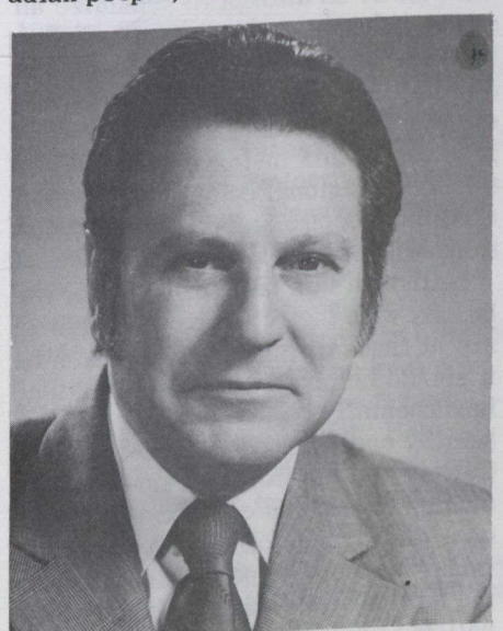
Allan J. MacEachen, Secretary of State for External Affairs

The Minister first reviewed Canada's general approach to external relations, pointing out that one of the most important conclusions of the 1970 foreign policy review was that Canadian foreign policy was an extension abroad of domestic policy. "The objectives of foreign policy must be relevant to Canadian national needs and interests if it is to attract the support of the Canadian people," he said.