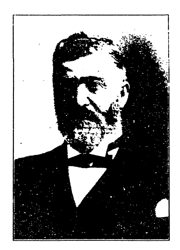
Exocu Frence Brows