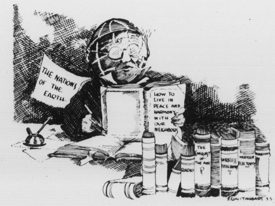
"HE'S AN EXPERT ON SOME LINES, BUT HERE'S ONE BOOK HE NEEDS TO STUDY!"

Down through the ages there has gradually evolved a system of specialization within our social order. For us to specialize in any particular line of endeavor, which did not in itself actually produce the necessities of life, compelled us to make some working arrangement with our fellows, so that in return for our labor on their behalf we might receive from them the material which would enable us to continue our work in our chosen field. To carry out this co-operation on a large scale as we have it today, necessitated the formation of a medium of exchange. This medium of exchange is something I am willing to accept from someone elsein return for my labors, something I know will be acceptable to others who are