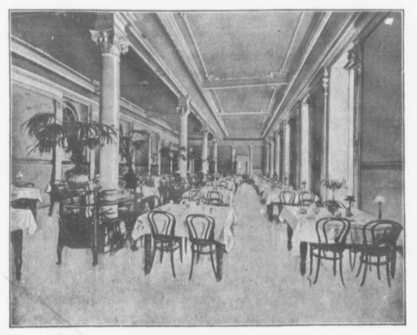
THE DINING ROOM-WELLAND INN.

between the East and West, reaching through its own and connecting lines, the large centres of both Canada and the United States.