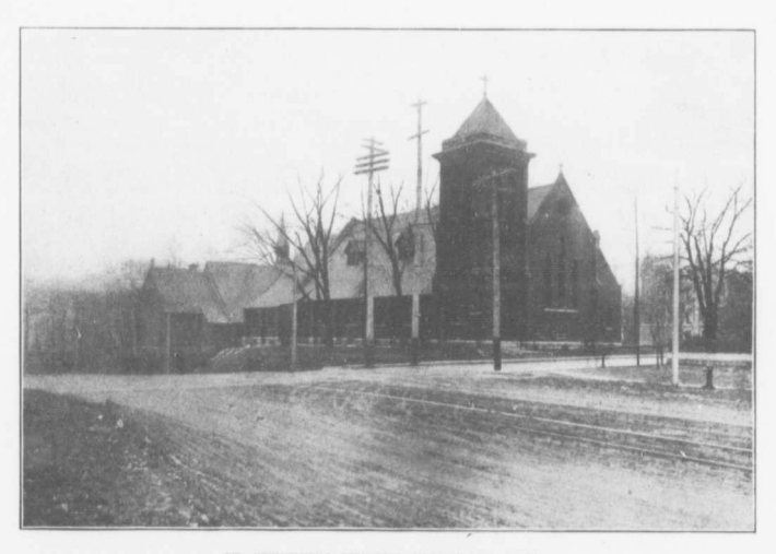
ST. STEPHEN'S CHURCH, WEREDALE PARK, Dorchester Street and Atwater Avenue.

Few Churches occupy a more commanding position than St. Stephen's, or are better situated as regards the English population of the city and Westmount. Its location has been well called "A Strategic Point." The attractive environment of this comfortable and commodious place of worship at the entrance to Weredale Park, its beautiful Parish Hall and Chapel and all its appointments, afford every facility for strenuous and useful work. To the West of the buildings, and facing on the Park, is an ample space, which, it is hoped, some day will be occupied by residences for the clergy. The total area of the property is twenty-five thousand feet.