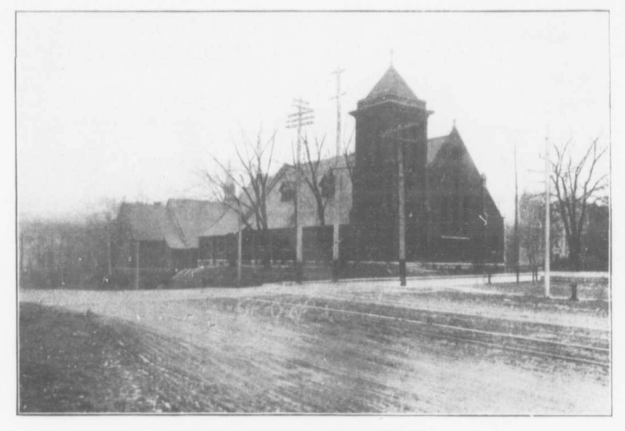
ST. STEPHEN'S CHURCH, WEREDALE PARK, Dorchester Street and Atwater Avenue.