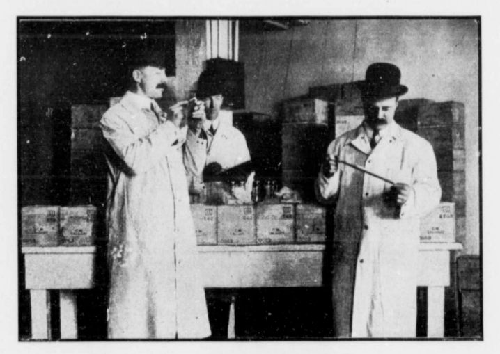
FIG. 1.—AT THE CALGARY GRADING STATION.

In addition to the use of the regular brand of the creamery, of special "creamery letter" allotted by the Department, the same churning number should be plainly stamped in the upper right-hand corner of all the packages that are put up from the same churning and as soon as they are packed. If the marking be not promptly and properly done there is a danger of a mix-up in the identity of the packages, and this should, of course, be scrupulously avoided. Each operator may select his own system of numbering the churnings. Cushioned rubber type should be used for numbering the packages, and they should be at least three-quarters of an inch in depth.