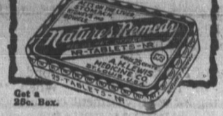
Get a 25c. Box.