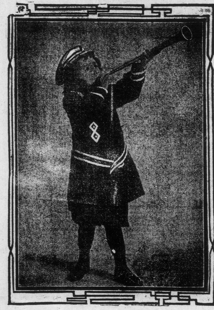
TIMES FASHION HINTS.

back and turning suddenly pale. "I knew you would be surprised," the does know Perhans things will work ize your good fortune,