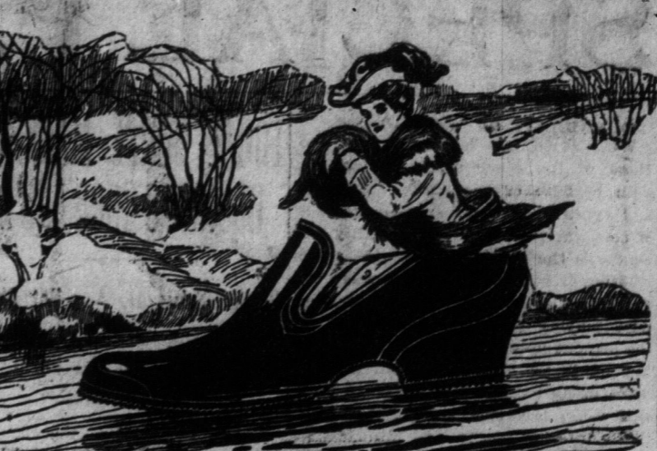
THE CANADIAN RUBBER COMPANY MONTREAL LIMITED

Free Until Cured. Not asking a penny in advance or on deposit. You only pay price of belt when cured, and in many cases as low as $5, or for cash, full wholesale discount. Forty years' continuous success has brought forth many imitations. Beware of them. You can try the original, the standard of the world, free until cured, then pay for it. Call or send for one to-day, also my illustrated book, giving full information free, sealed, by mail.