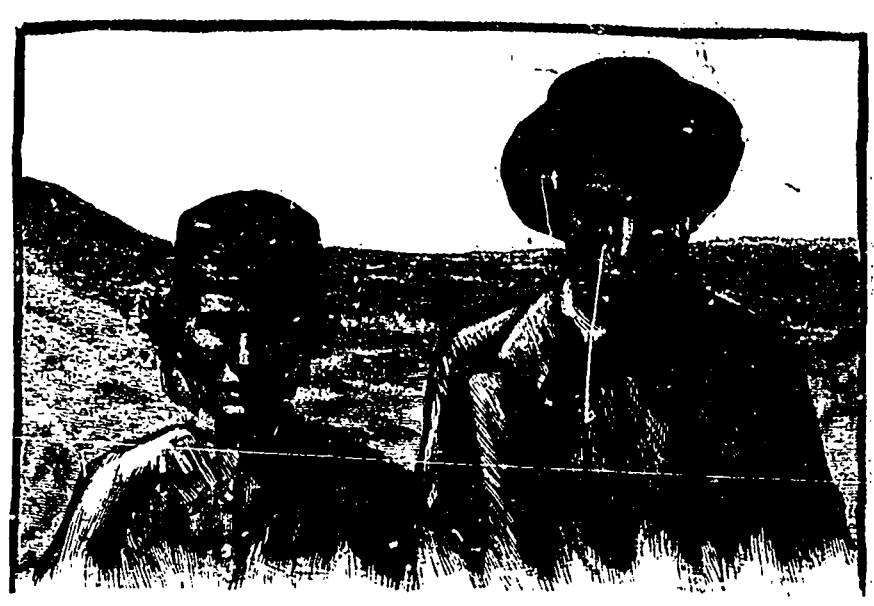
TWO INDIAN BOYS.