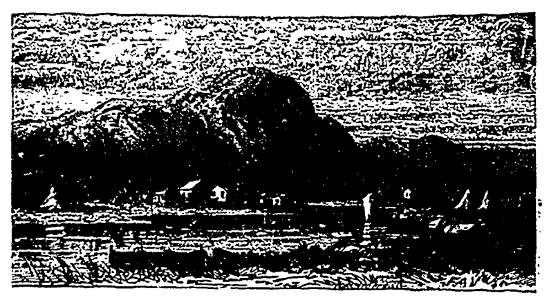
OLD H.B. FACTORY, FORT WILLIAM, LAKE SUPERIOR.

a year (at Christmas and on the Queen's Birthday) a small amount of liquor was measured out to their own employees, a pint only to each head of a family, and this only upon an order countersigned by the governor and attending physician. They were well aware of its evil influence and kept it away. How different is this from the unscrupulous conduct of many traders of the present day, on the coasts of Africa, and other savage lands! There the fire water is made to do its deadly work upon the unfortunate savages, and so the labours of the missionary are often undone.