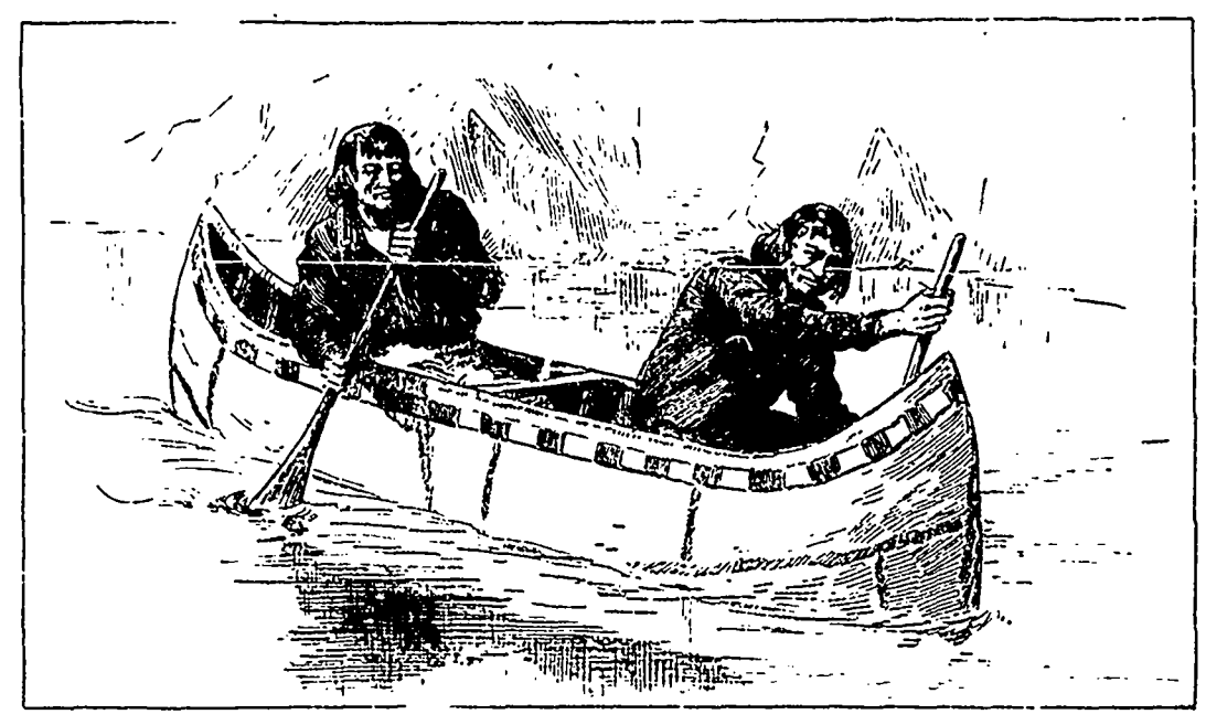
INDIANS AND THEIR CANOE.