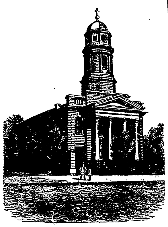
ST. GEORGE'S CATHEDRAL, KINGSTON, AS IT IS.

Even babies in arms have bracelets of silver round their wrists and ankles.