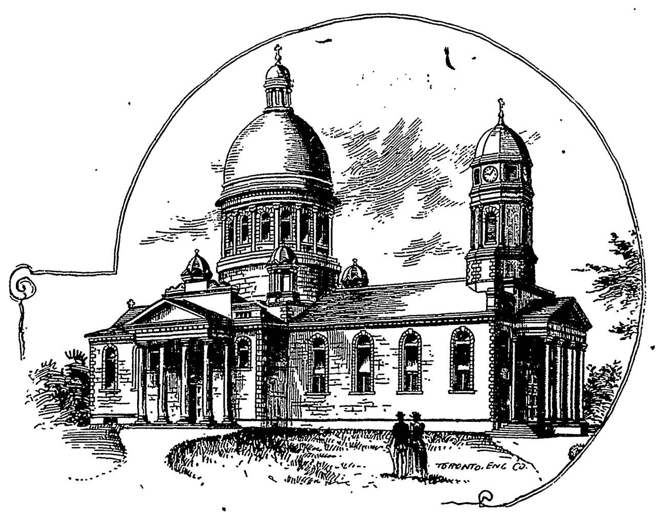
ST. GEORGE'S CATHEDRAL, KINGSTON, ONTARIO, PROPOSED ENLARGEMENT.

enlargement that is about to take place, it will remain intact—the proposed changes being merely additions to be erected at the chancel end, as shewn in the accompanying illustration. The work of enlargement was commenced last April, and it is expected will be completed in time for divine service to be held in it on Easter Sunday next. The British Whig of Kingston gives the following interesting account of the parish:—