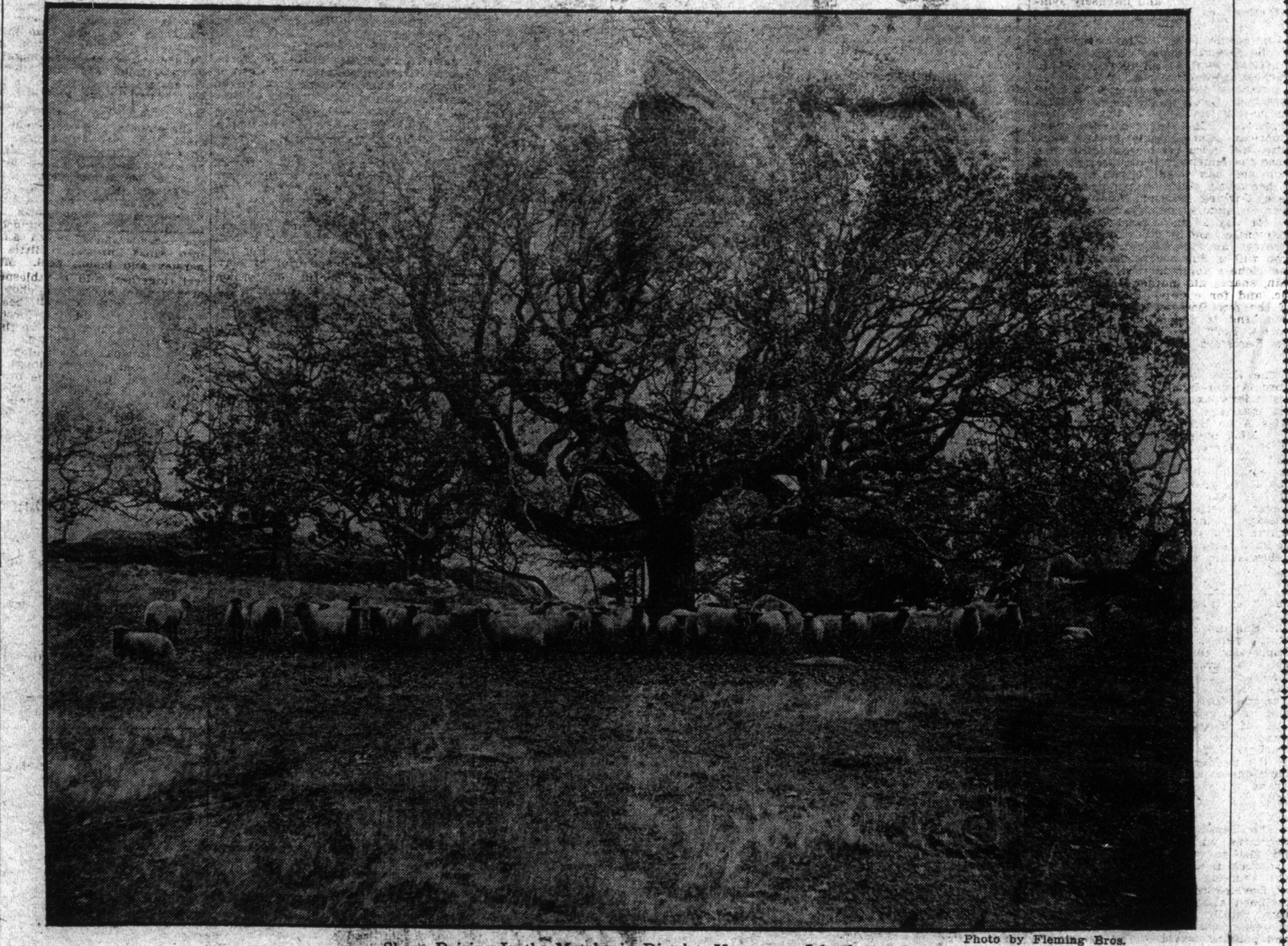
Sheep Raising in the Metchosin District, Vancouver Island.

Wyandottes, those cockerels which appear raw boned should not be rejected; they are often mistaken for pullets, as they do not get "furnished" as quickly as the others.