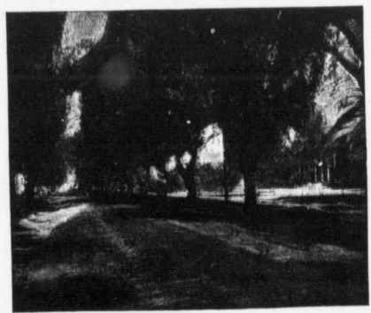
MAGNOLIA AVENUE, RIVERSIDE, CALIFORNIA

Some one told me lately of a woman who came here a few years ago with consumption, and $75,00. She bought a tiny strip of sand, stretched out a tent for a habitation, when presto! some one offered to purchase her real estate at an advance. Two tents were then erected, and from this small