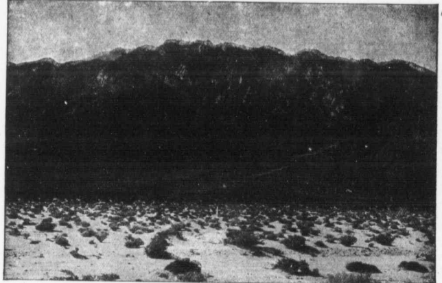
SAGE BRUSH DESERT BEFORE IRRIGATION

dusty, but even here we were always stumbling across small homesteads, fairly smiling, some of them, with green grass and trees. It seems as if there are few spots where some one