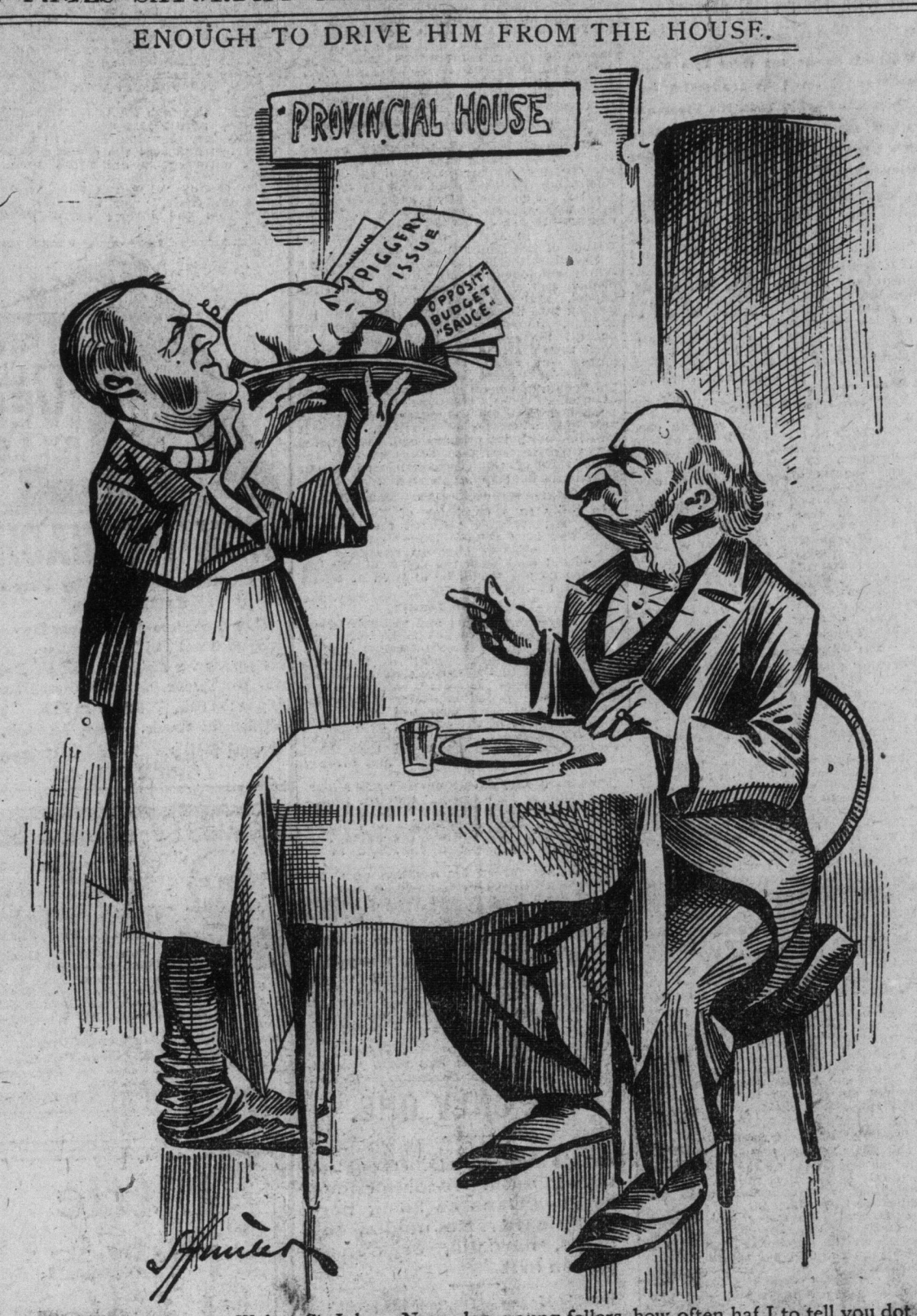
MR. HARDYSTEIN TO WAITER ST. JOHN: NOW DEN, YOUNG FELLERS, HOW OFTEN HAF I TO TELL YOU DOT I HAS NO USE FOR PORK?

THE AMERICANS ARE ASKING THE CANADIAN GOVERNMENT TO BE ALLOWED TO SHIP THEIR GOODS THROUGH LAND INTO ALASKA.