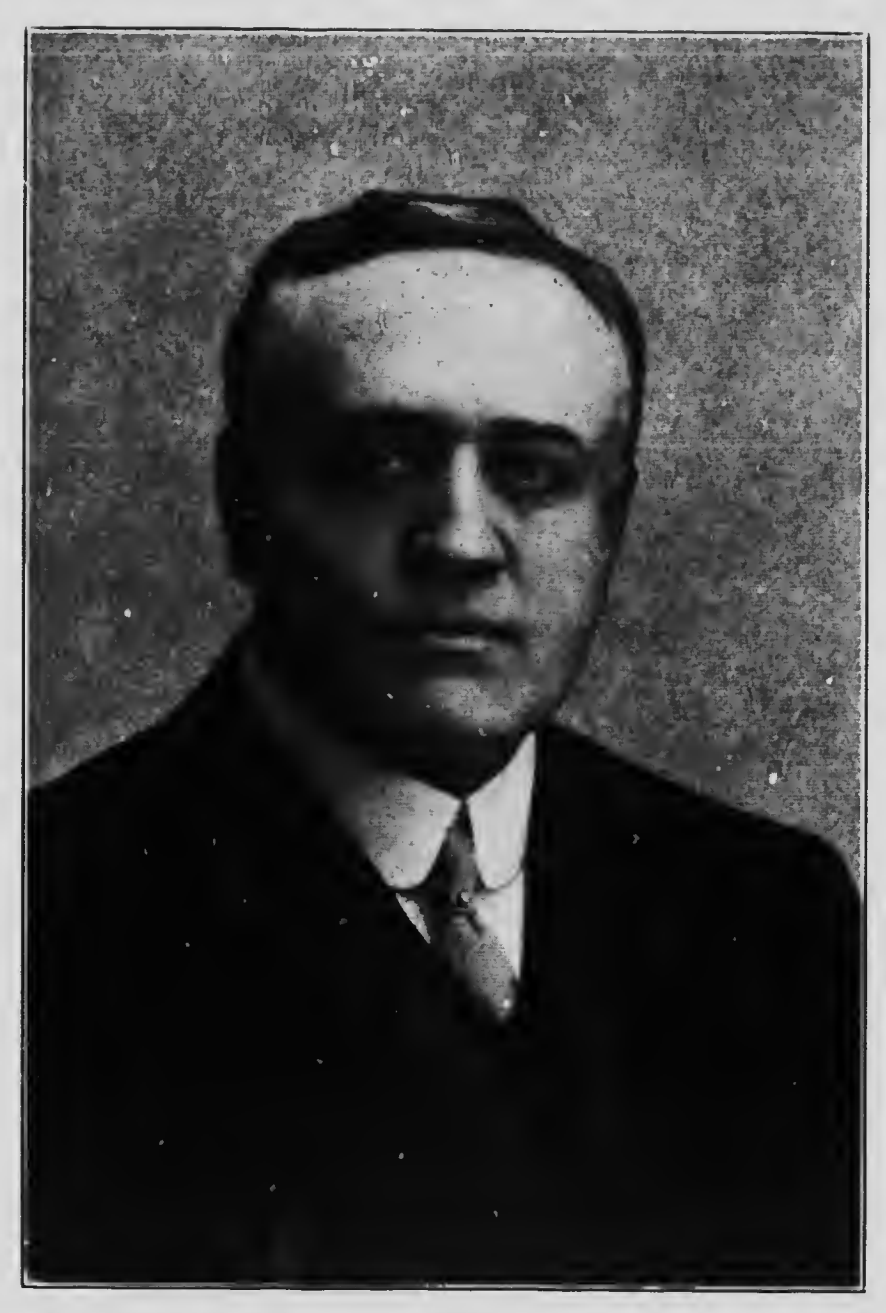
HON. W. J. BOWSER, K. C. Prime Minister