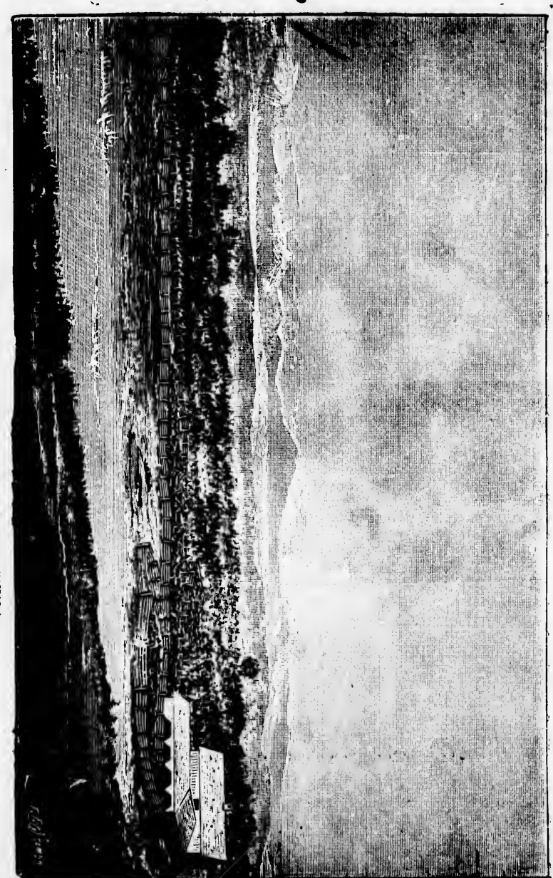
STOCK RANCHE IN THE TERRITORIES, WESTERN CANADA.