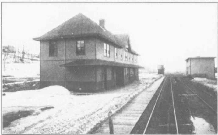
RAILWAY STATION AT QUEBEC BRIDGE —This photograph shows the station, ready for occupation, a few feet from Pontville .