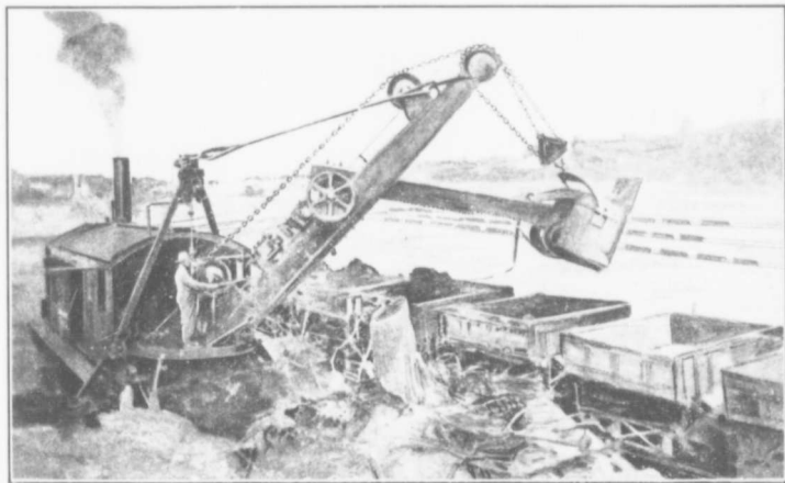
THE FREIGHT YARDS —This photograph shows part of the Pontville freight yards and the already leveled site of the G. T. P. shops.

Pontville —The only land subdivision facing the Quebec Bridge.