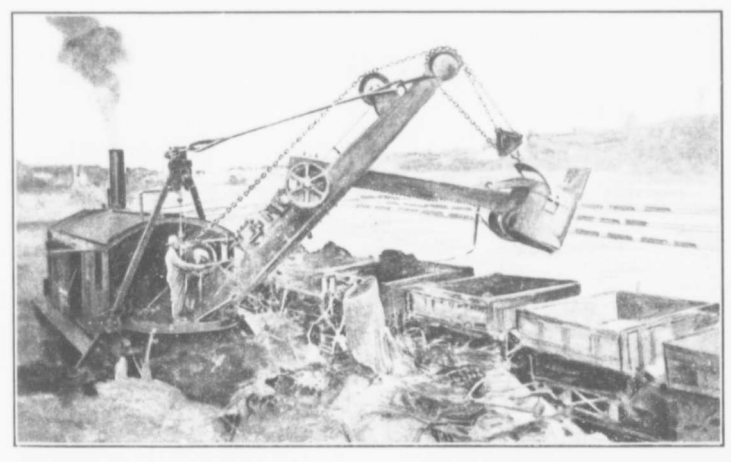
THE FREIGHT YARDS—This photograph shows part of the Pontville freight yards and the already leveled site of the G. T. P. shops.

Pontville The only land subdivision facing the Quebec Bridge