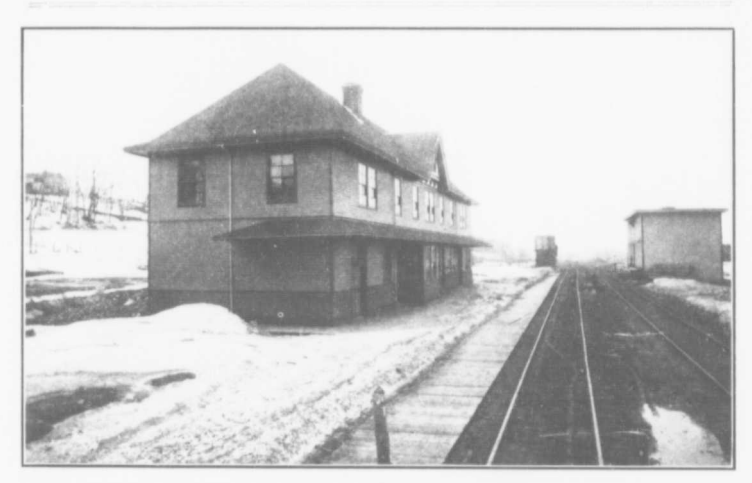
RAILWAY STATION AT QUEBEC BRIDGE—This photograph shows the station, ready for occupation, a few feet from Pontville.