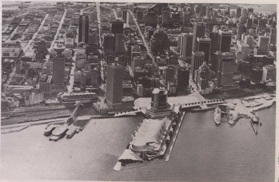
Canada Place is to include a cruise ship terminal and the Canadian pavilion at Expo 86. The pavilion will subsequently be converted to Vancouver's trade and convention centre.

The striking design of Canada Place is the product of a joint venture team of three firms of architects: Musson Cattell and Partners and Downs-Archambault, Vancouver and Zeidler Roberts Partnership, Toronto. Based on a marine theme, its shape suggests a prow thrusting into Burrard Inlet, a roofline of sails catching the wind and the superstructure of an