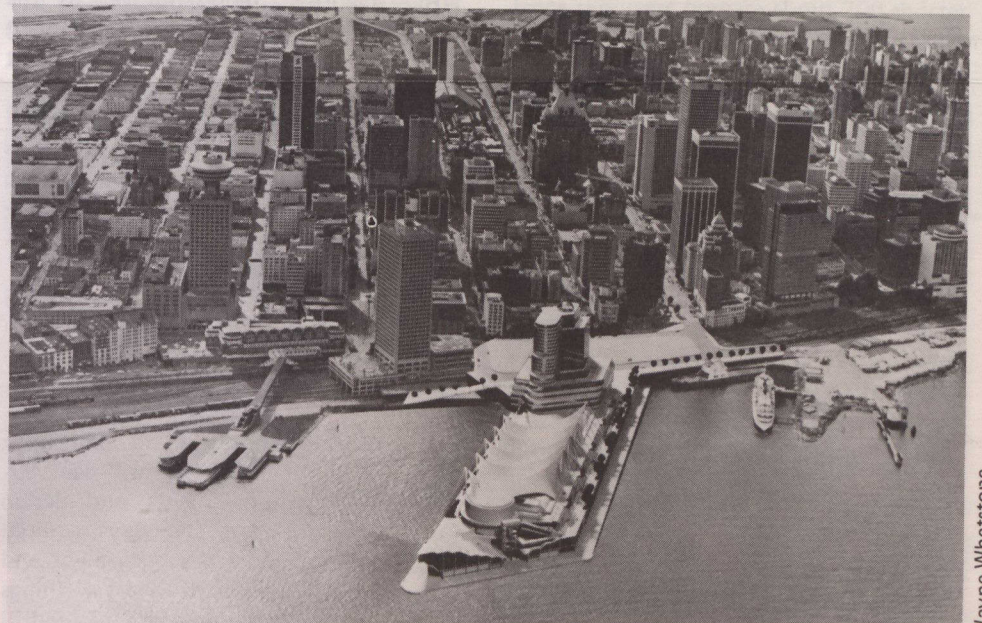
Canada Place is to include a cruise ship terminal and the Canadian pavilion at Expo 86. The pavilion will subsequently be converted to Vancouver's trade and convention centre.

The striking design of Canada Place is the product of a joint venture team of three firms of architects: Musson Cattell and Partners and Downs-Archambault, Vancouver and Zeidler Roberts Partnership, Toronto. Based on a marine theme, its shape suggests a prow thrusting into Burrard Inlet, a roofline of sails catching the wind and the superstructure of an