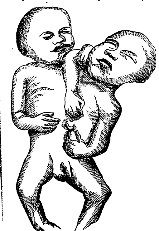
ance of the monster.