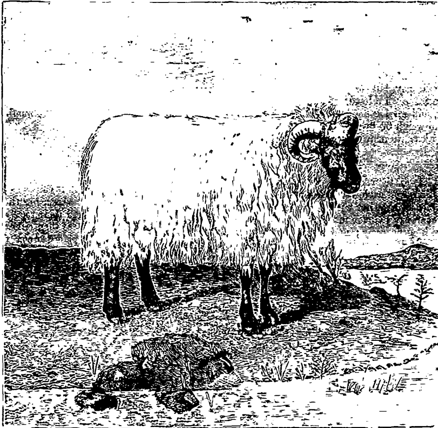
BLACK-FACE SCOTCH SHEEP.