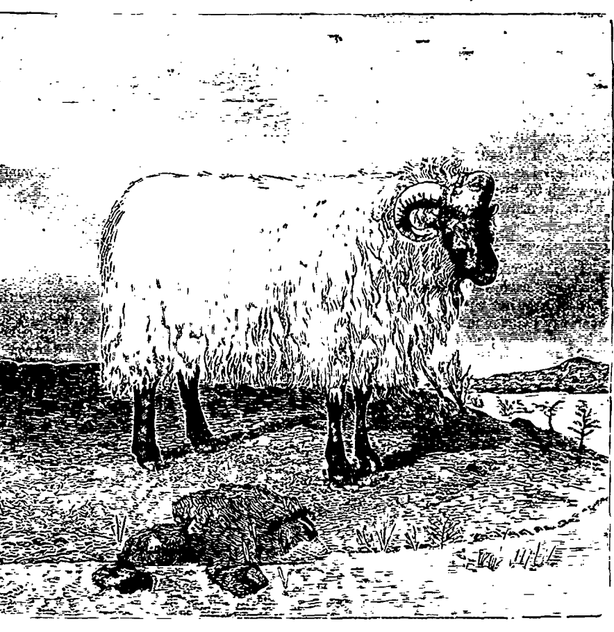
BLACK-FACE SCOTOH SHEEP.

II. The harrow needed varies with the soil and its condition.