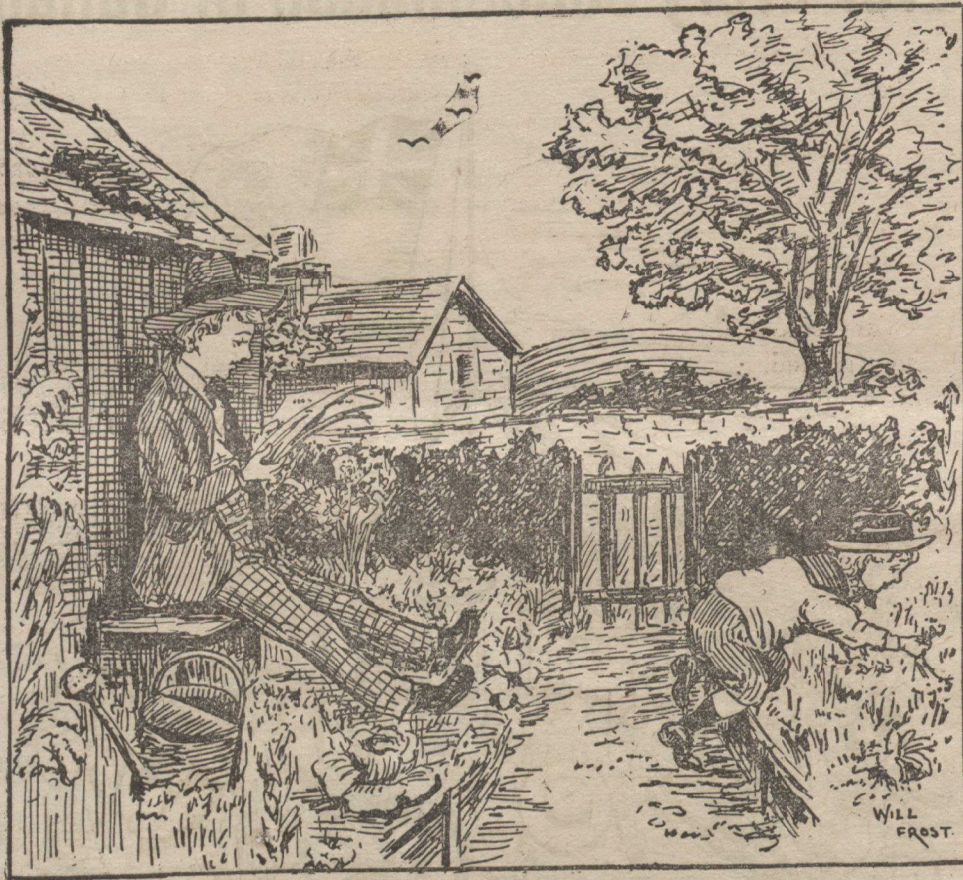
For the 'Messenger.'