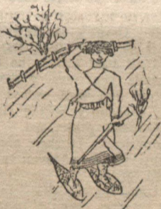
Elmer F. (age 14) Papineauville Que.