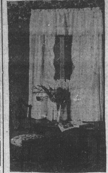
EMBROIDERED MUSLIN MAKES THIS HANG-

While a certain simplicity should be while a certain simplicity should be maintained in living room furnishings, as in the rest of the rooms in the house, there is more liberty for the use of pictures and other ornamentation. For this reason a plain wall covering is preferable. It will be a better background for pictures and for everything in the room. The overdraperies may be of figured material, but not too strong or brilliant in design. The use of rich design and coloring in the furniture coverings and such accessories as the table covers and pillows is al-