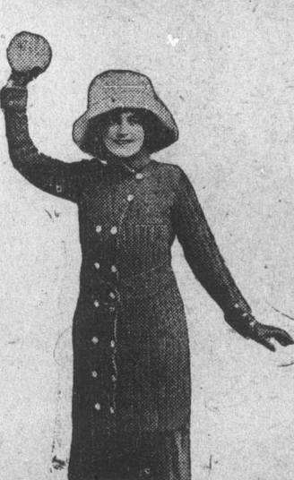
sweaters, falling into line, are also

New Feature in Sweaters. Yoke effects are just now the fad on every type of costume from night-gowns to theater wraps, and winter