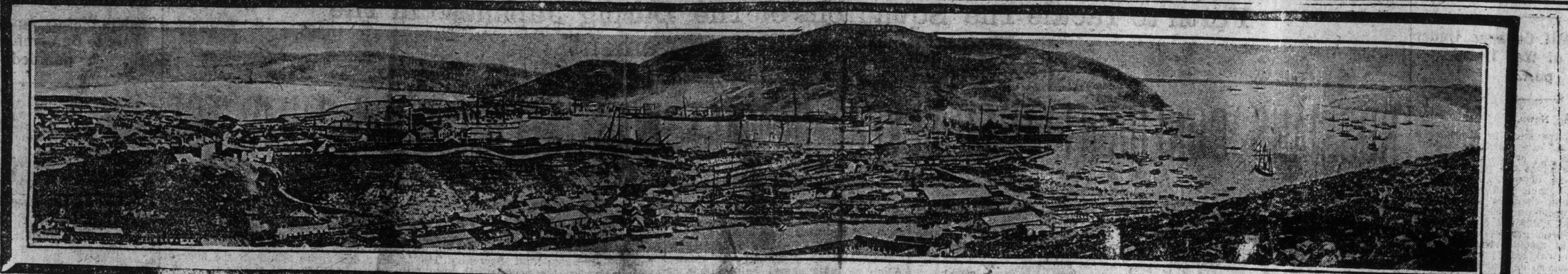
PANORAMIC VIEW OF PORT ARTHUR, SHOWING THE HARBOR ENTRANCE AND NAVAL BASIN.