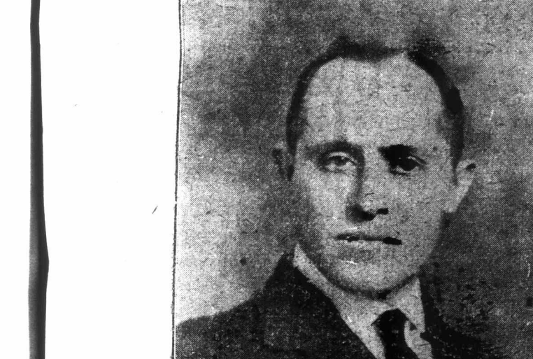
Dr. E. O. Platt, who will stand for re-election for Mayor of the City of Belleville for the Year 1919.