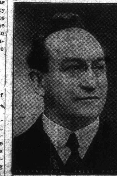
for Mayoralty honors for 1919.