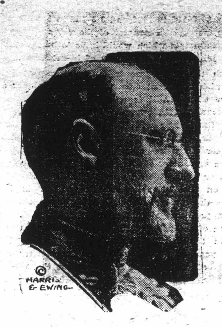
SIR CECIL SPRING-RICE, Who is retiring as British Ambassador at Washington,