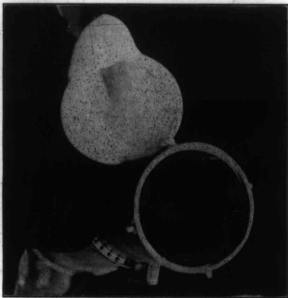
SHOWING DUST BAG REMOVED FROM CLEANER

You know when you sweep with a broom how necessary it is to raise all the windows, to cover you hair, piano and other articles.