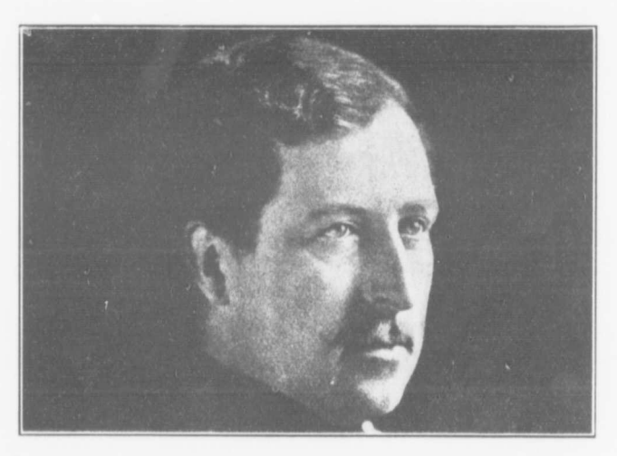
THE KING OF THE BELGIANS