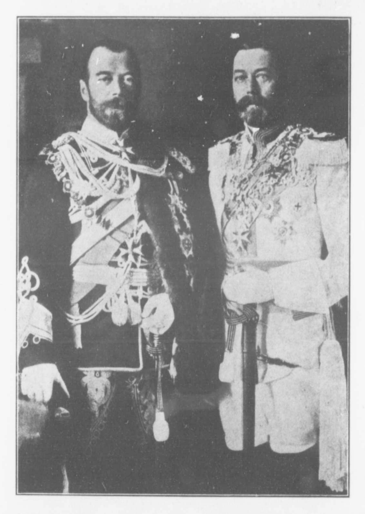
CZAR OF RUSSIA